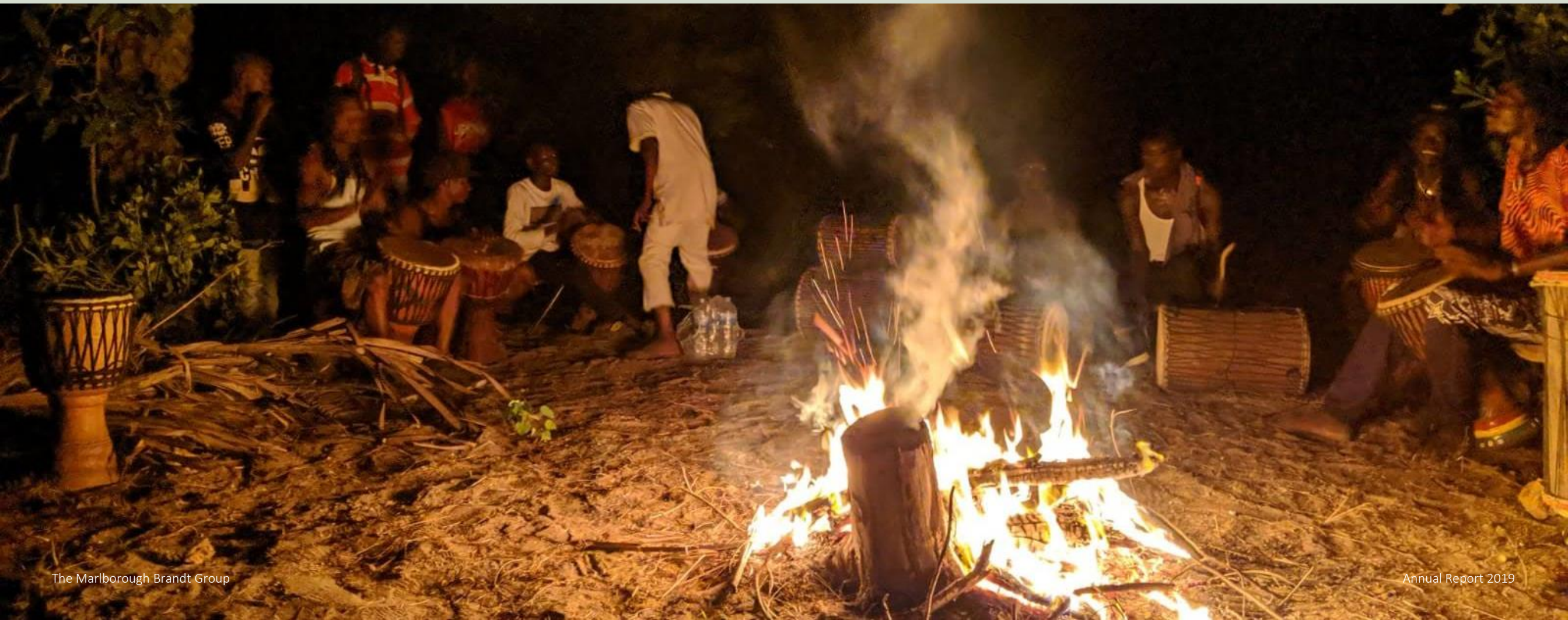
Photo: The Roots Kombo Sillah Band Gunjur, including long time Gunjur Community Link Volunteer Wiki Lamin, perform at Bolongbaa Beach Lodge and Camping on Gunjur Beach.

Governing instruments: Memorandum & Articles of Association Incorporated 04.09.14