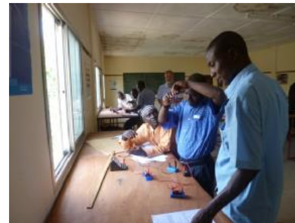
Photo: Experimenting with electrical circuits at a Teacher Development Workshop

For more information about Raise Gambia , visit: www.raisegambia.co.uk