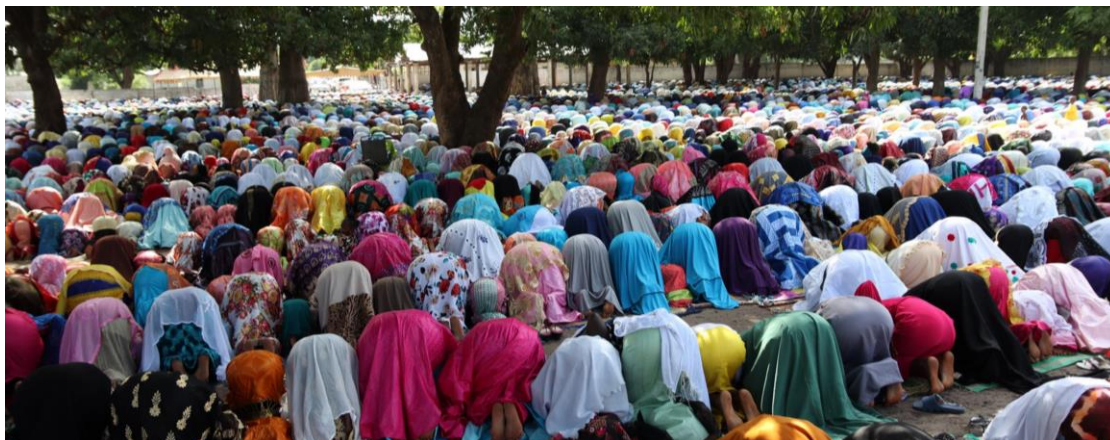
The Marlborough Brandt Group – Tobaski in Gunjur – festival of Eid Al-Adha

The 2019 trip had three programmes through which identity and migration were explored and better understood: