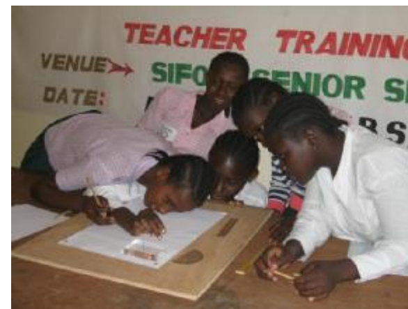
Photo: Local students engaged in Refraction of Light experiment