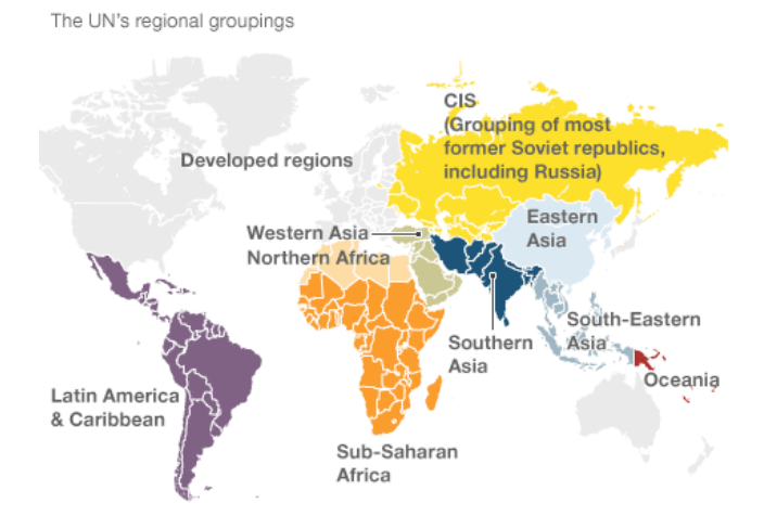
Figure 1 - Map showing the regions where the MDGs apply in practice. www.bbc.co.uk